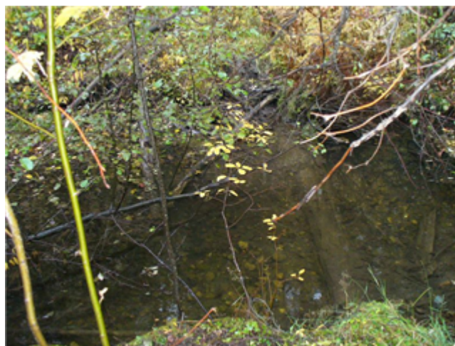
Across Reach Aerial (No image found)