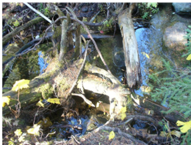
Across Reach Aerial (No image found)