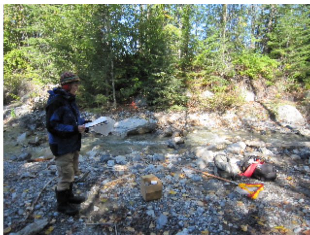
Across Reach Aerial (No image found)