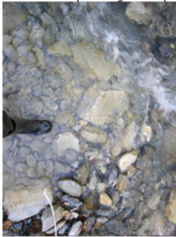
Miscellaneous Substrate (No image found)