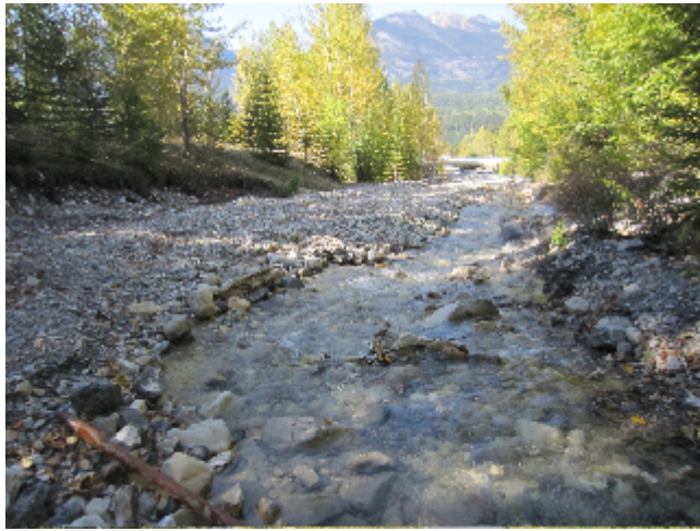
Down Stream Field Sheet (No image found)