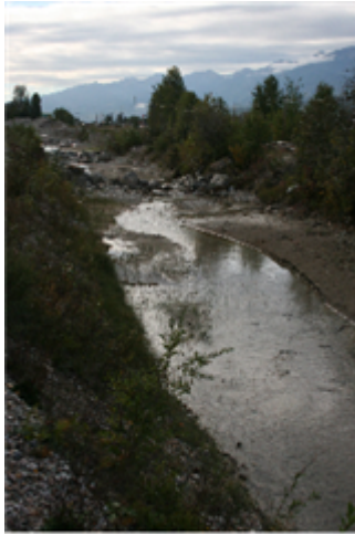
Down Stream Field Sheet (No image found)