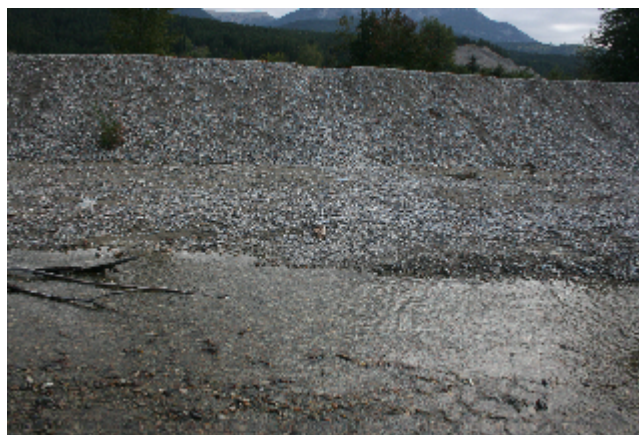
Across Reach Aerial (No image found)