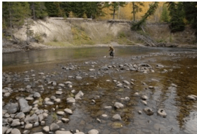
Across Reach Aerial (No image found)