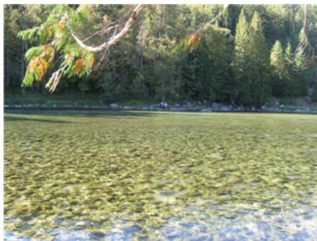
Across Reach Aerial (No image found)