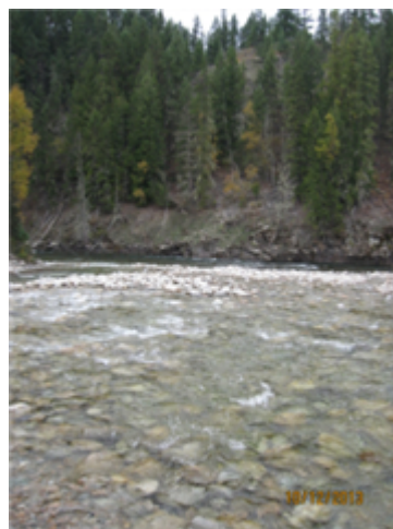
Across Reach Aerial (No image found)