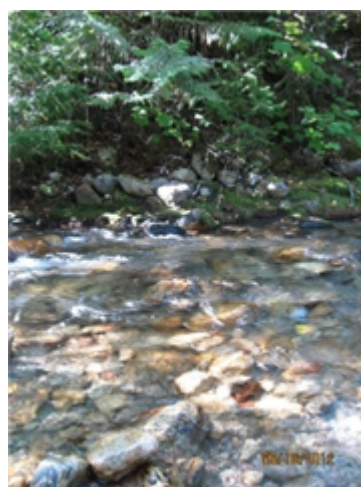
Across Reach Aerial (No image found)