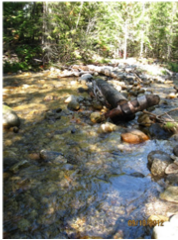
Down Stream Field Sheet (No image found)