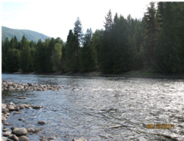
Down Stream Field Sheet (No image found) Miscellaneous (No image found)