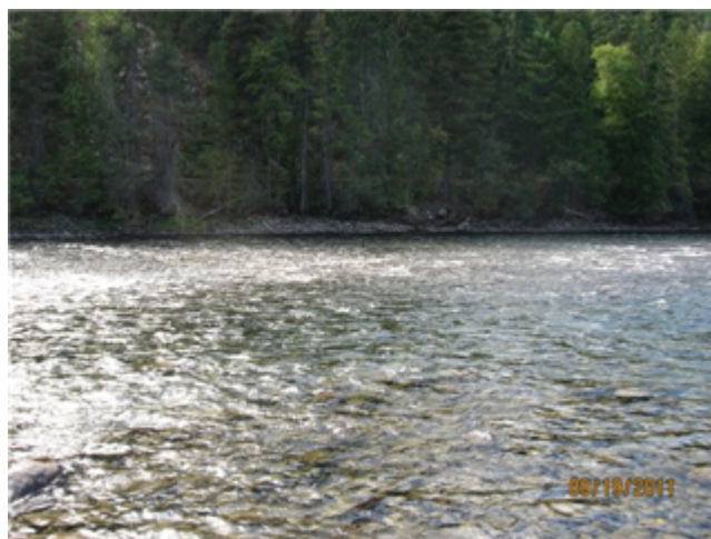
Across Reach Aerial (No image found)