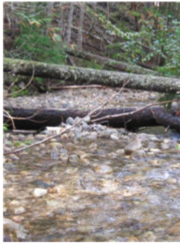
Down Stream Field Sheet (No image found) Miscellaneous (No image found)