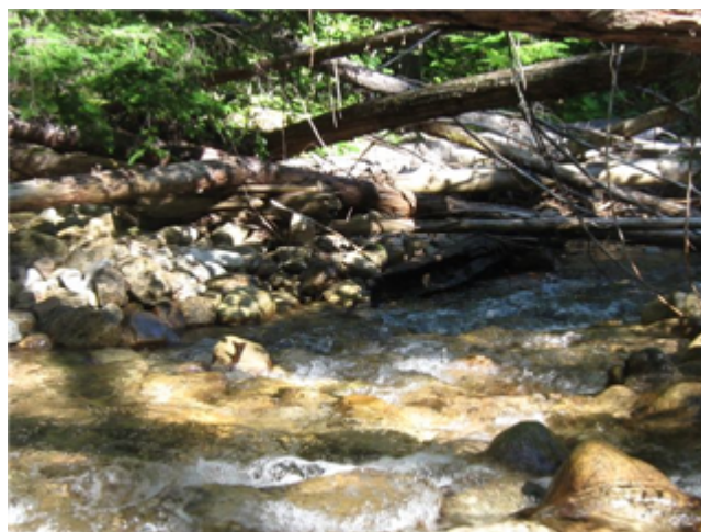
Across Reach Aerial (No image found)