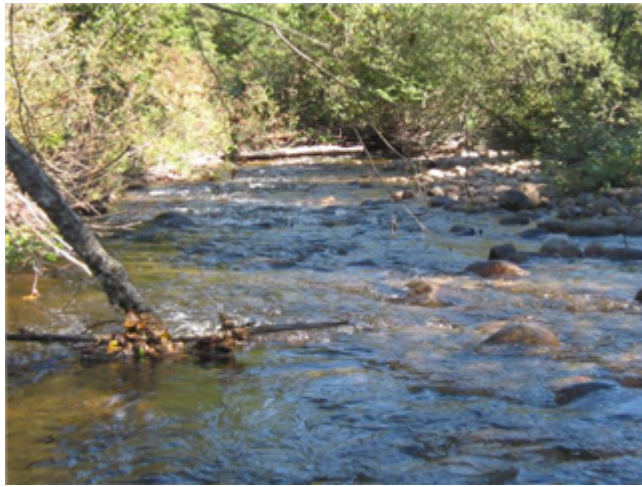
Down Stream Field Sheet (No image found) Miscellaneous (No image found)