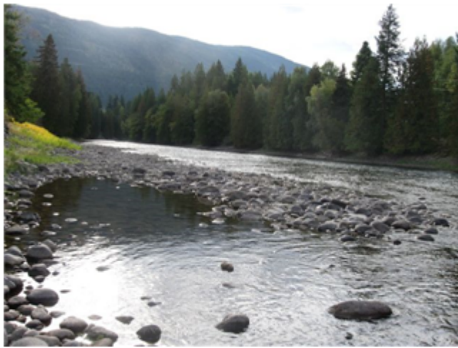
Down Stream Field Sheet (No image found) Miscellaneous (No image found)