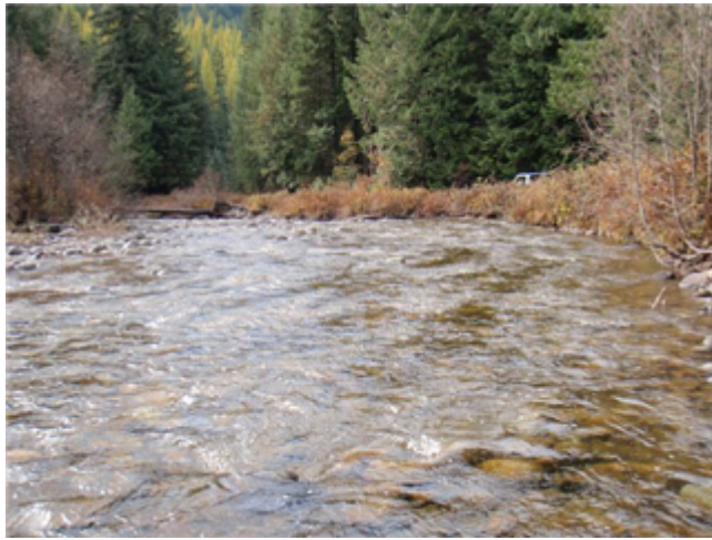
Down Stream Field Sheet (No image found) Miscellaneous (No image found)