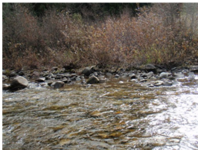
Across Reach Aerial (No image found)