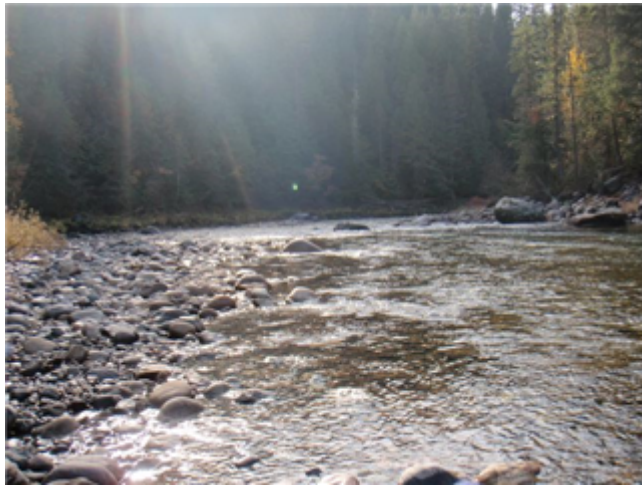
Down Stream Field Sheet (No image found) Miscellaneous (No image found)