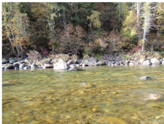
Across Reach Aerial (No image found)