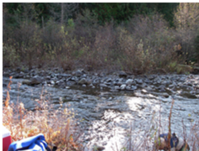
Across Reach Aerial (No image found) Down Stream (No image found)