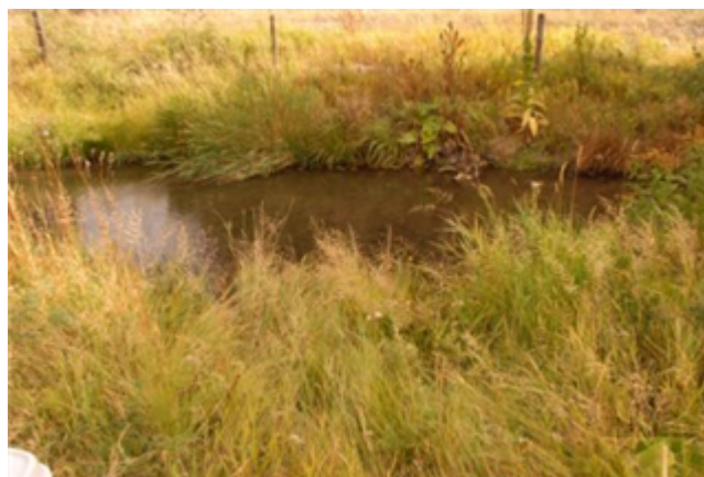
Across Reach Aerial (No image found)