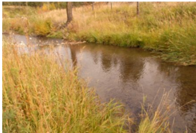
Down Stream Field Sheet (No image found) Miscellaneous (No image found)