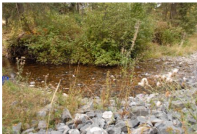
Across Reach Aerial (No image found)