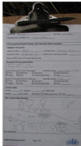
Field Sheet Miscellaneous (No image found)