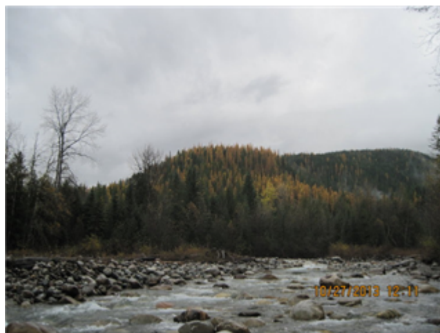
Across Reach Aerial (No image found)