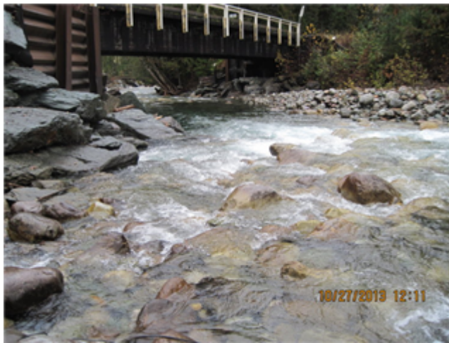
Down Stream Field Sheet (No image found) Miscellaneous (No image found)