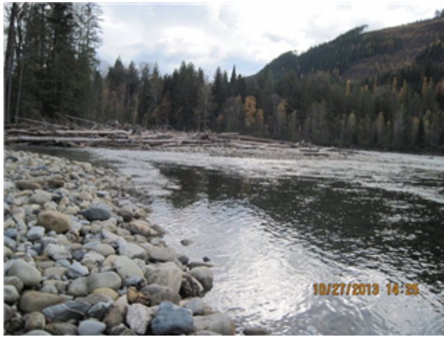
Down Stream Field Sheet (No image found) Miscellaneous (No image found)