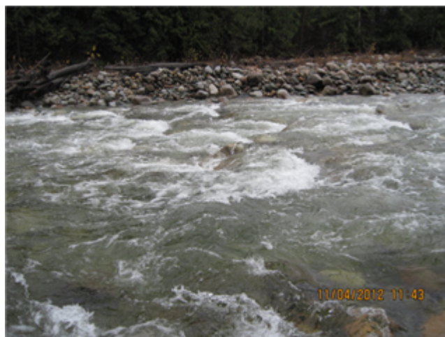
Across Reach Aerial (No image found)