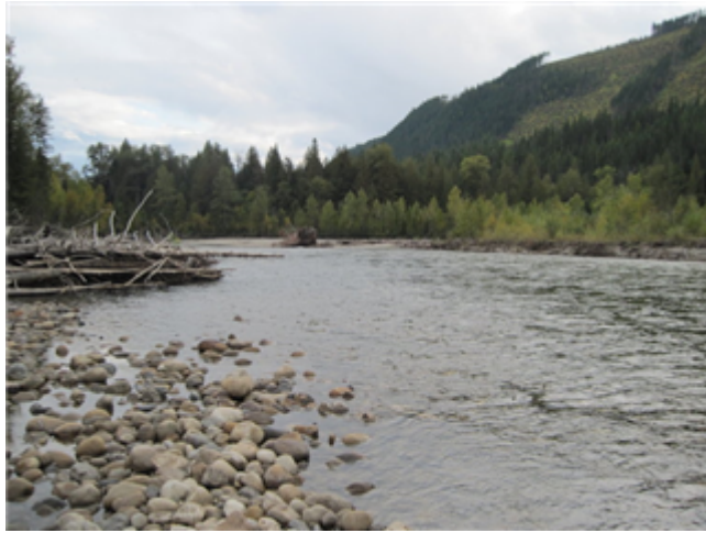
Down Stream Field Sheet (No image found) Miscellaneous (No image found)