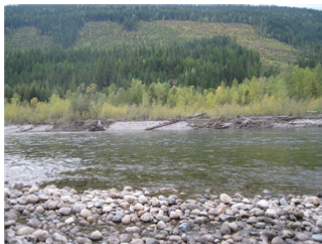
Across Reach Aerial (No image found)