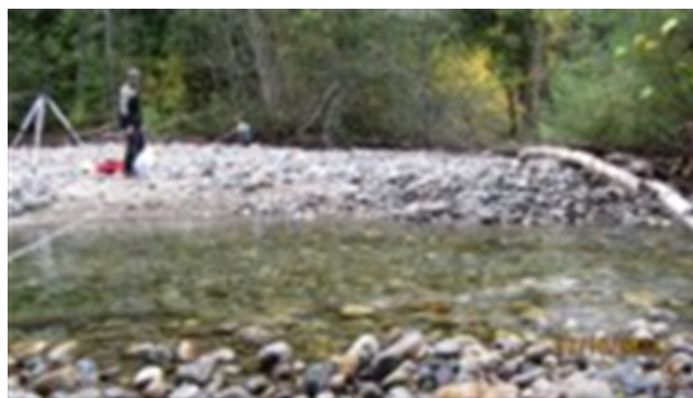
Across Reach Aerial (No image found)