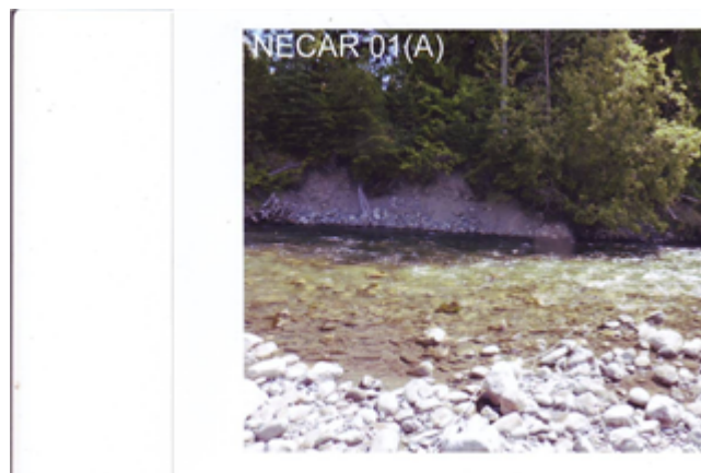
Across Reach Aerial (No image found)