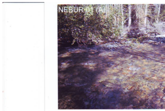
Across Reach Aerial (No image found)